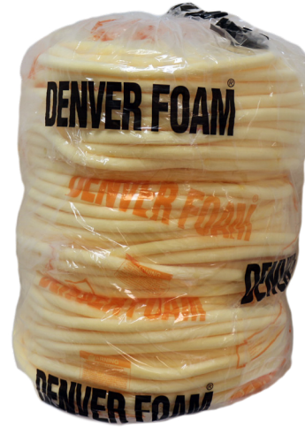
The picture above details how “bales” are packaged into “Master Bags”